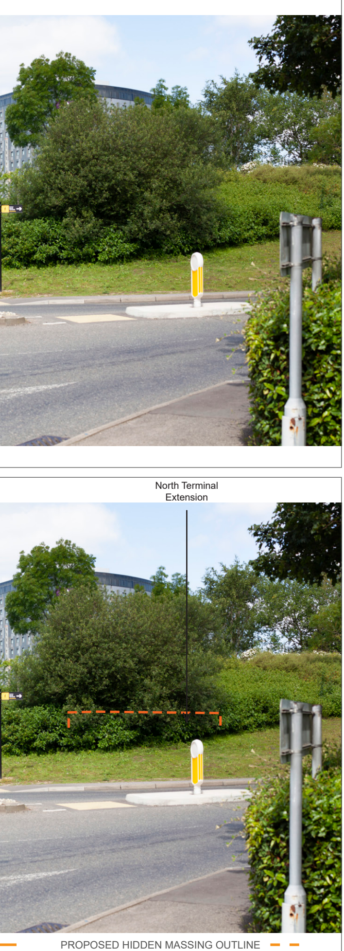
FIGURE NO: 8.9.3