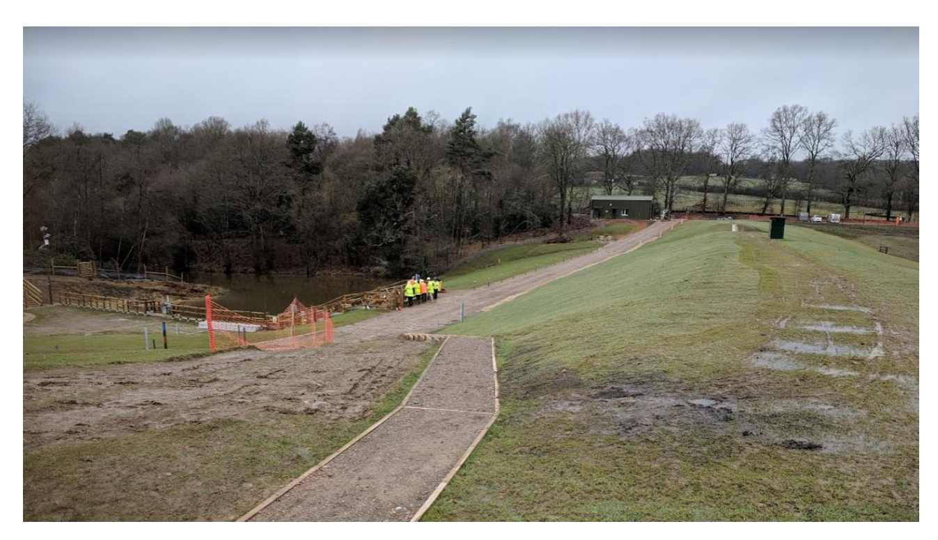
Clays Lake project completion hand-over in 2019