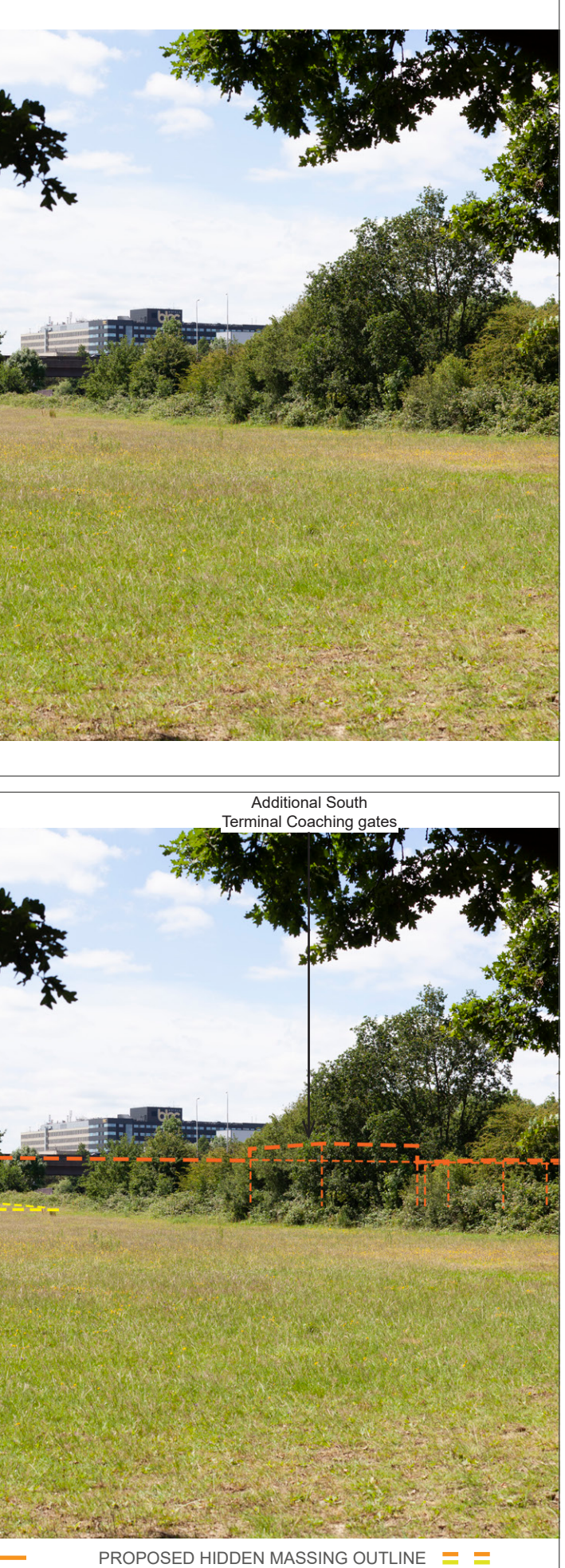
FIGURE TITLE: Existing and Proposed Wireline - Summer Viewpoint 8

DOCUMENT: Preliminary Environmental Information Report